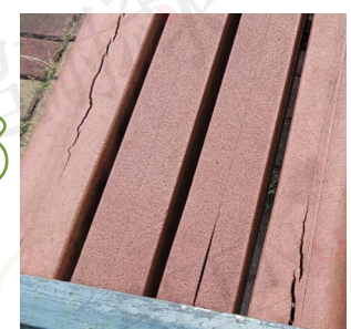
Absorb water Deformation fracture